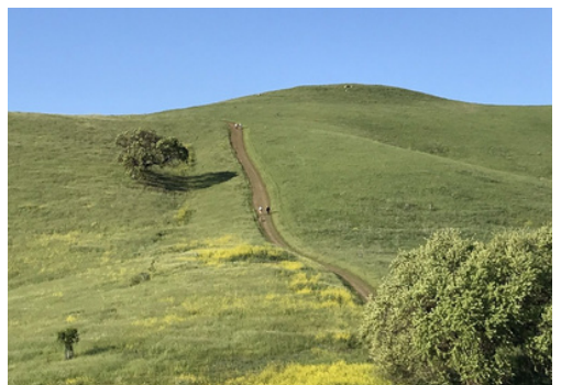
STOP THE CITY FROM BUILDING MOUNTAIN BIKER THRILL RIDE "FLOW TRAILS"